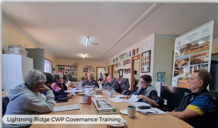
Lightning Ridge CWP Governance Training

The next MPRA meeting is being held in Cobar on December 5, 6 & 7.